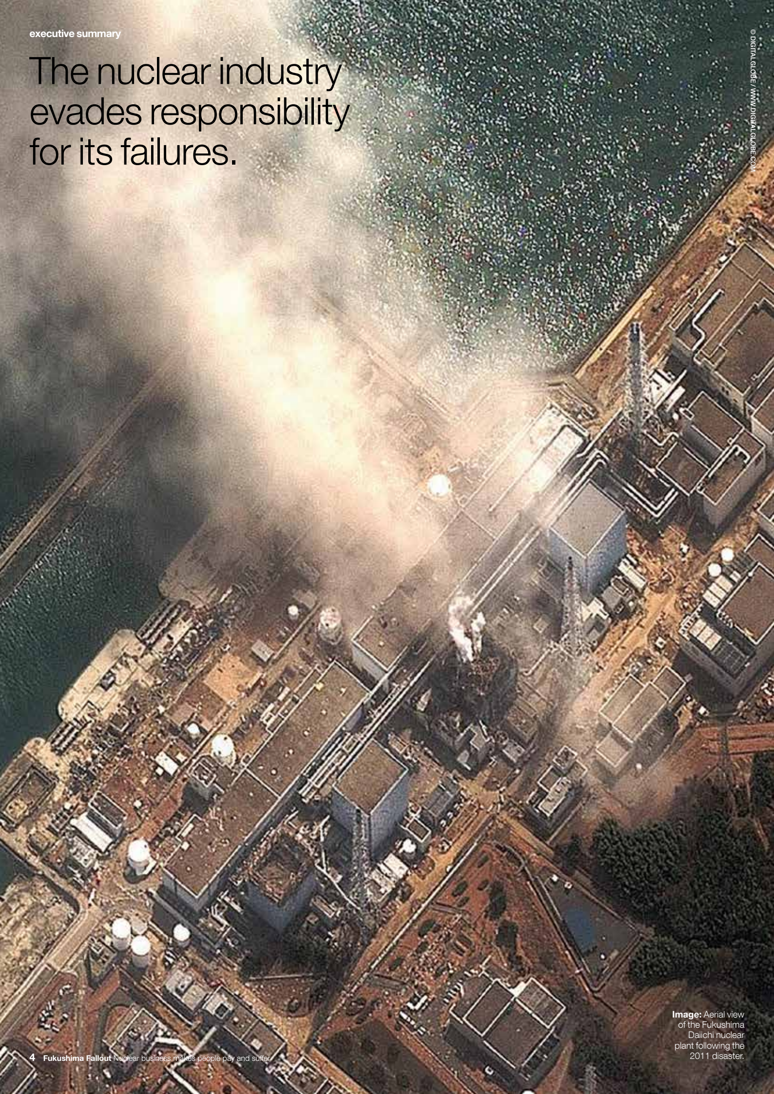
Image: Aerial view of the Fukushima Daiichi nuclear plant following the 2011 disaster.