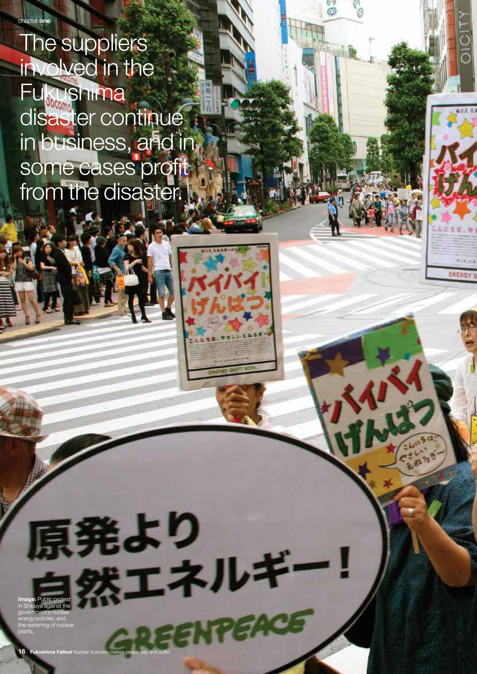
Image: Public protest in Shibuya against the government's nuclear energy policies, and the restarting of nuclear plants.

The suppliers involved in the Fukushima disaster continue in business, and in some cases profit from the disaster.