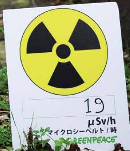
Image: A Greenpeace sign indicates a radioactive hot spot in a storm water drain between houses in Watari, approximately 60km from the Fukushima Daiichi nuclear plant.

The current nuclear liability conventions are intended to protect the nuclear industry, and do not offer sufficient compensation to victims.