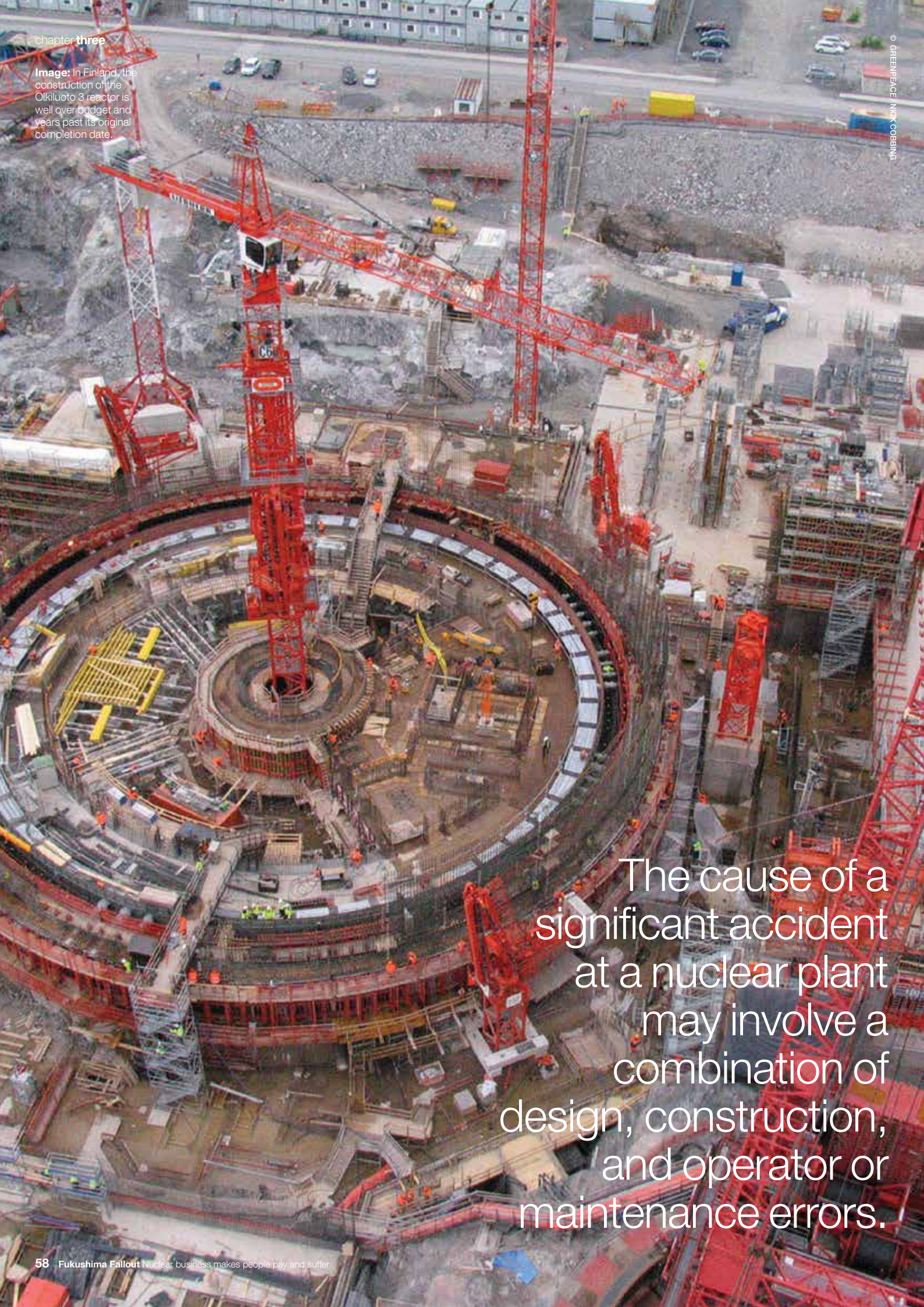
Image: In Finland, the construction of the Olkiluoto 3 reactor is well over budget and years past its original completion date.

The cause of a significant accident at a nuclear plant may involve a combination of design, construction, and operator or maintenance errors.